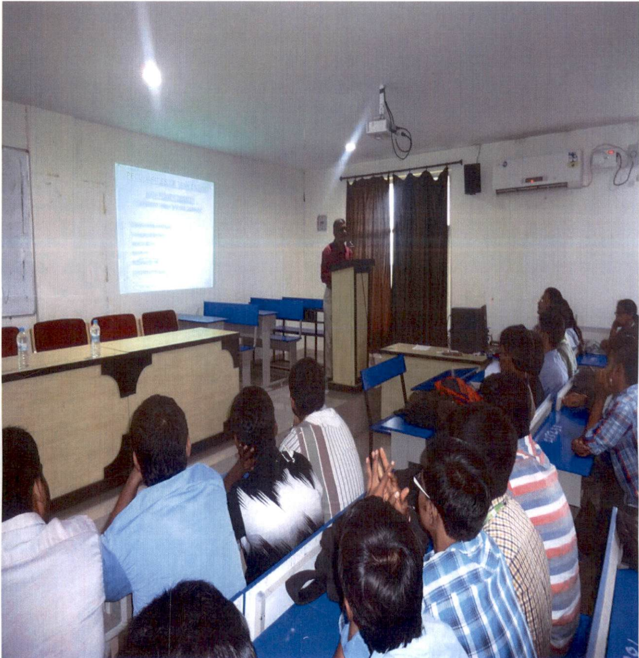
Guest Lecture on the "Constitutional Rights for SC/ST students" on 23/09/2019

*Approved by AICTE *Permanently affiliated to JNTUH *NBA Accreditation Kandlakoya (V), Medchal Road, Hyderabad -501401.